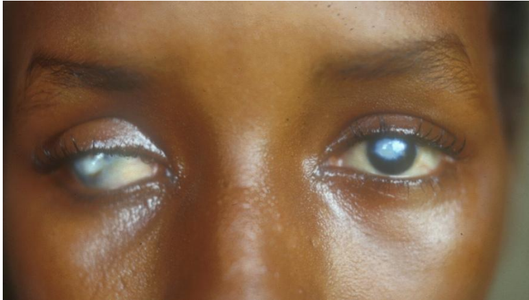
Corneal scarring: the front part of the eye is damaged